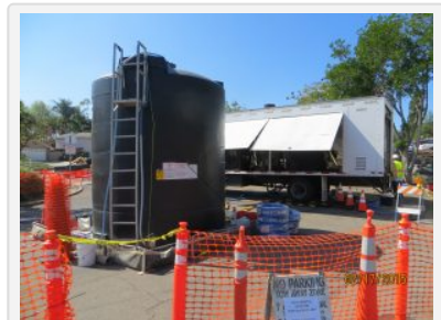
Lot mitigation, Feb, 2015

In 1991, lacking space to house its growing materials collection and program offerings, SDPL's Master Plan called for the building of a new San Carlos Branch Library. Any available land in San Carlos was grabbed up fast by developers.