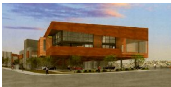
Proposed San Carlos Branch Library

Pre-Monthly Used Book Sales. LIFE Members receive a 10% discount on items purchased at the Library Foundation's Library Shop located in the downtown Central Library. Thank you one and all.