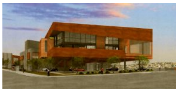
Proposed San Carlos Branch Library

purchase books at our Friday Pre-Monthly Used Book Sales. LIFE Members receive a 10% discount on items purchased at the Library Foundation's Library Shop located in the downtown Central Library. Thank you one and all.