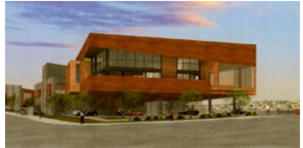
Proposed San Carlos Branch Library

year. ANOTHER BENEFIT: Life Members also receive a 10% discount on items purchased at the Library Foundation's Library Shop located in the downtown Central Library. Thank you one and all.